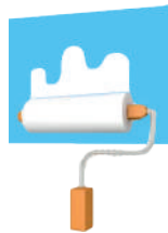
15 m 2 ( 2 coats )