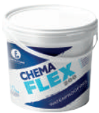
Flex paint 15 Kg